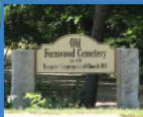
Where the sisters grave is located